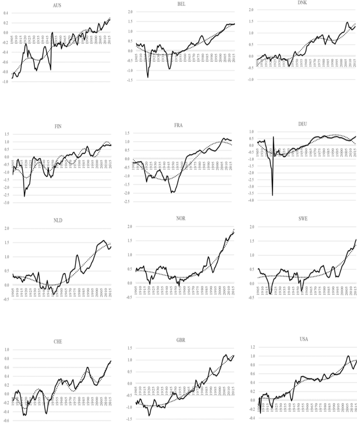
Figure 1: Actual data and estimated Fourier expansion series

Note: The abbreviations of countries are AUS for Australia, BEL for Belgium, DNK for Denmark, FIN for Finland, FRA for France, DEU for Germany, NLD for Netherlands, NOR for Norway, SWE for Sweden, CHE for Switzerland, GBR for the United Kingdom, and USA for the United States.